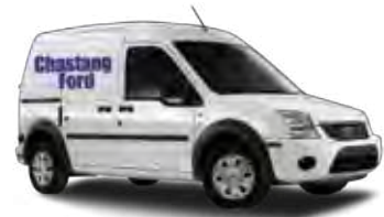
Chastang Ford Fleet & Commercial Sales